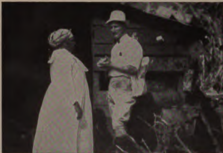
"Ah don rightly know mah age, mahster; ah gone los' mah age paper"